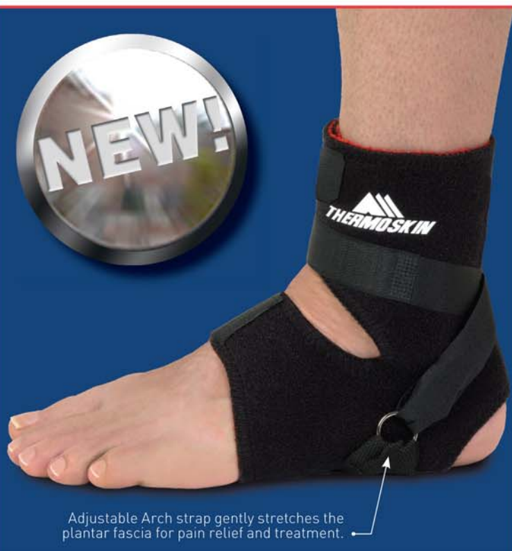
Adjustable Arch strap gently stretches the plantar fascia for pain relief and treatment.

205-5920 No. 6 Road, Richmond BC Ph: 1-800-667-3442