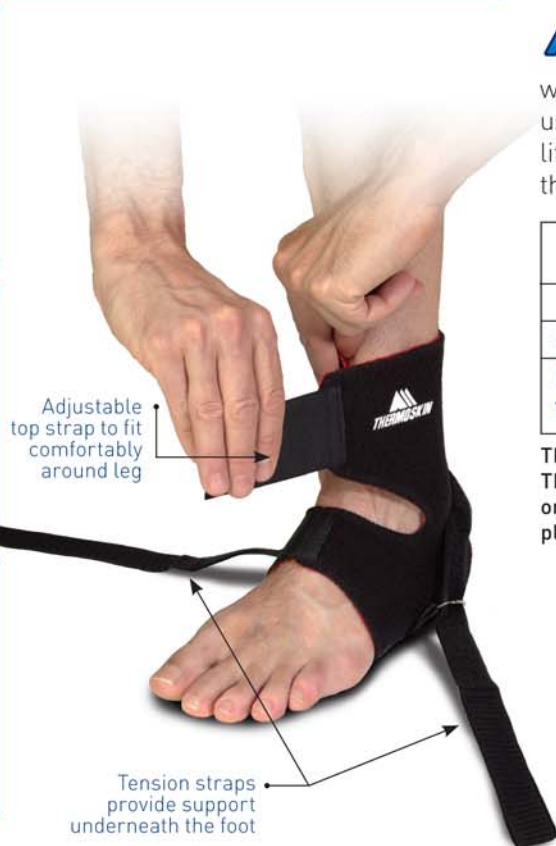
Adjustable top strap to fit comfortably around leg