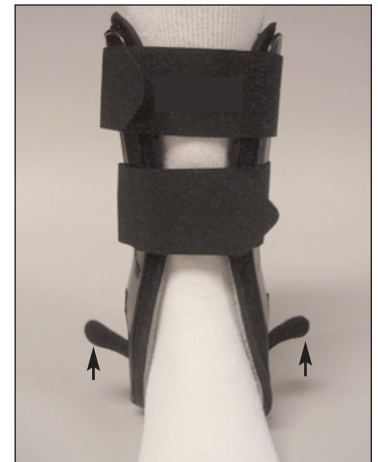
Figure 5 – Adjust vertical side straps