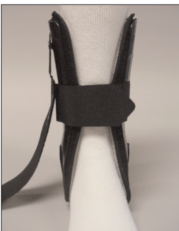
Figure 3 – Center side shells along ankle and leg