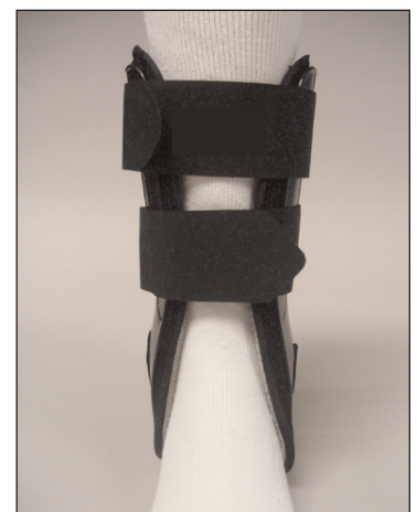
Figure 6 – Secure straps