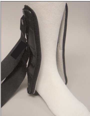
Figure 2 – Position heel on center pad